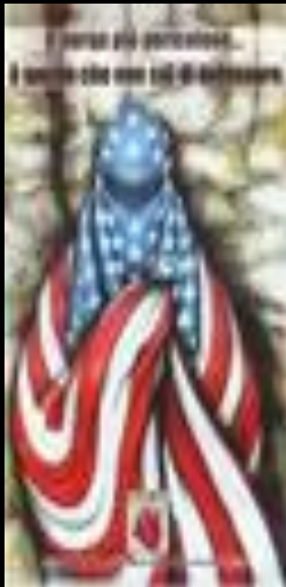
Holy Women are called witches

1 Corinthians 11:15 But if a woman have long hair, it is a glory to her: for her hair is given her for a covering.